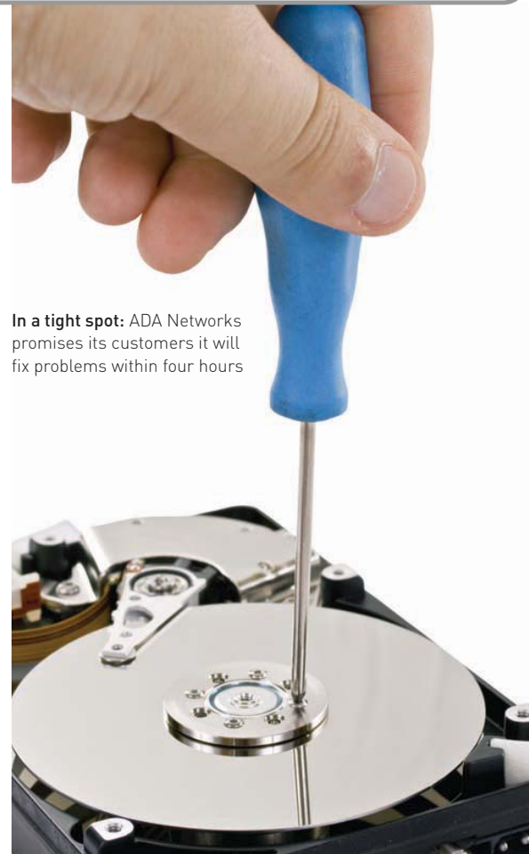
In a tight spot: ADA Networks promises its customers it will fix problems within four hours

"Our customers are primarily large organisations. Typically, they are large enterprises or at the high end of the market, of all kinds. There are universities and corporates such as Tetley, 50 of Arco's