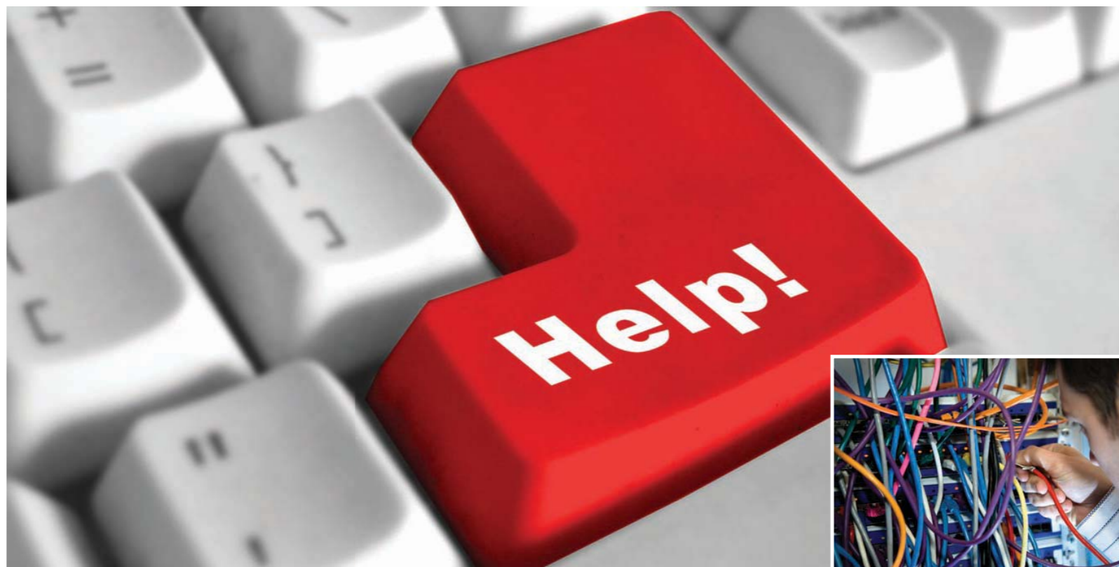
Pushing the right buttons: Networks First has 35 highly qualified engineers, while Comms-care has recently recruited another six

Customers need guaranteed service-level agreements (SLAs) and a customised approach to their individual needs.